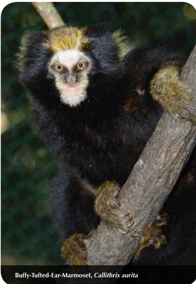
Buffy-Tufted-Ear-Marmoset, Callithrix aurita

The NAP for the conservation of central Atlantic Forest mammals was consolidated in two steps. First it was made a compilation of biological data and threats for each species, with basis on published data and information provided by researchers.