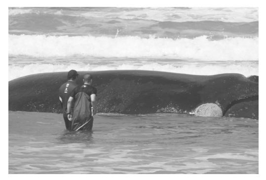
Figure 1. Southern right whale in the second day of stranding (8 September 2010)

following the stranding. Because of the large (about 2 m) breaking waves (with a surf zone ~300 m across), the low tide, and the animal's size, a major concern of the rescue attempt was that this action would put