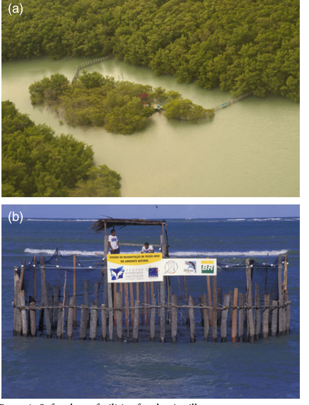
PLATE 1 Soft-release facilities for the Antillean manatee Trichechus manatus manatus built in (a) an estuarine and (b) a marine area.

The criteria used for the selection of individuals for translocation (Table 1) follow the Brazilian Manatee Reintroduction Protocol and the IUCN Reintroduction Guidelines (IUCN, 1998; Lima et al., 2007). After rehabilitation, selected individuals are moved by trucks and boats to staging areas (Plate 1). The manatees spend some time (15 days at the start of the project, increasing to 3–12 months