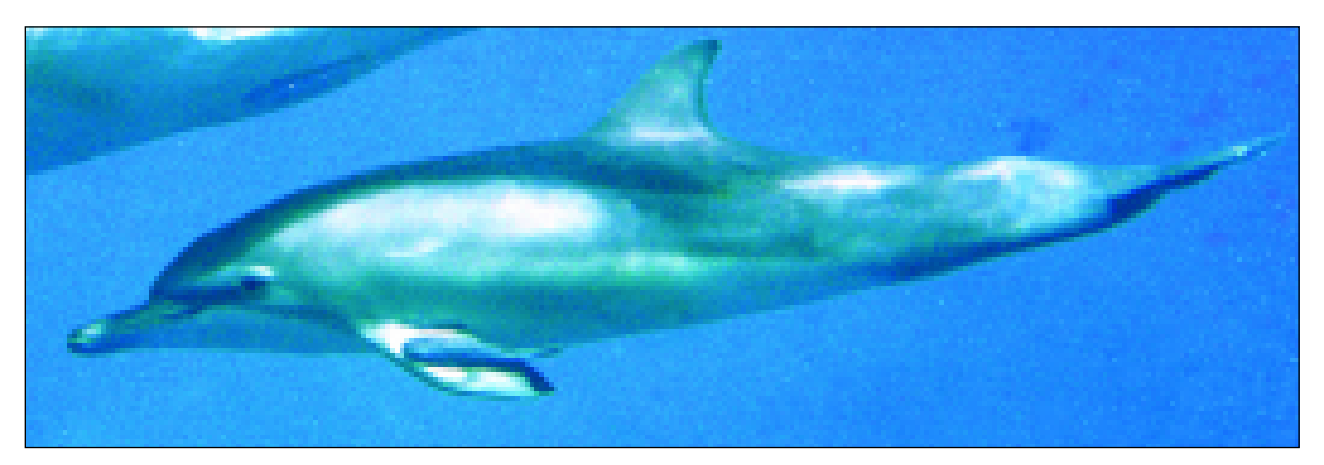
Fig. 11. A juvenile whalesucker ( Remora australis ) attached to the left flipper of a spinner dolphin calf. Note abraded skin on the fluke's upper side.