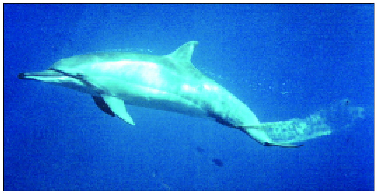
Fig. 7. A spinner dolphin voiding a cloud of particulate faeces. Note the sigmoid curve directed backwards formed by the hind-body on evacuation.