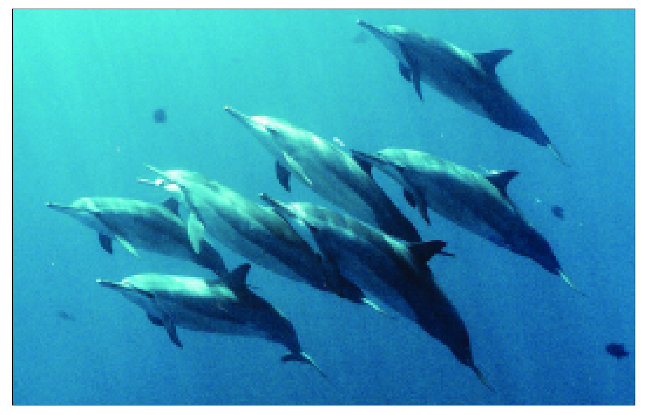
Fig. 1. A resting group of spinner dolphins ( Stenella longirostris ) swimming in formation at cruising speed, about to surface for breathing. Note the tongue of one dolphin hanging out of its open mouth.

Suckling began when a calf would position itself at its mother's side whilst nudging the mammary slit with the tip of its beak (Fig. 3). The calf's glottis was seen to move as the milk was taken from the mammary slit by suckling movements. Whilst the calf was suckling its eyes remained wide open, the tongue appeared to move and the sternohyoid muscle was contracting. After suckling at one side of the mammary slit, the calf moved to the opposite side. Suckling lasted between