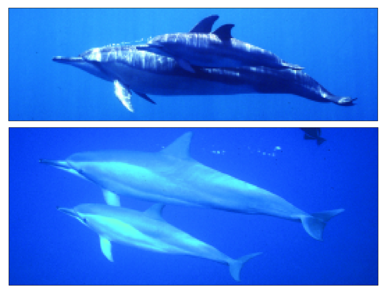
Fig. 2. A nursing spinner dolphin female and a calf shortly after breathing at surface (above); a female and a still suckling juvenile swimming side by side (below).

five and 20 sec (mean = 11.25; SD + 4.34; N = 16). Twice we recorded the calf taking milk which was squirted from the mammary slit, as if the liquid were taken through an "invisible" pipe. Once a calf was recorded taking mouthfuls of milk ejected from the mammary slit as into the water. Suckling calves ranged from the newborn (identifiable by their neonatal skin folds) to juveniles up to about 130 cm in length.