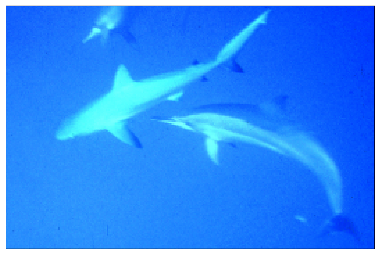
Fig. 10. Two male spinner dolphins chasing a Caribbean reef shark (Carcharhinus perezi). Photo by J. M. Silva Jr.

Fig. 9. Two spinner dolphins playing with a piece of seaweed ( Sargassum sp.), one of them holding the "toy" on its left flipper. Photo by J. M. Silva Jr.