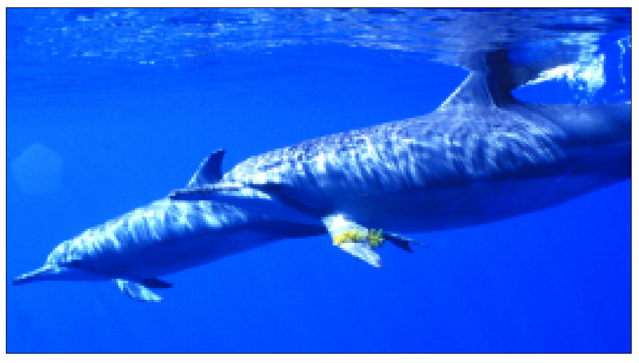
Fig. 9. Two spinner dolphins playing with a piece of seaweed ( Sargassum sp.), one of them holding the "toy" on its left flipper.