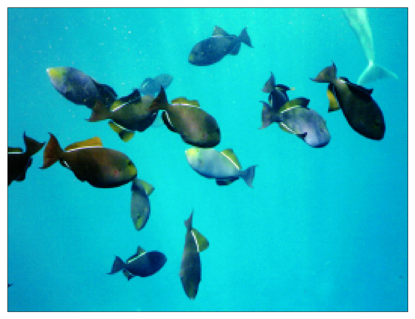
Fig. 13. A group of black durgons (Melichthys niger) picking up particulate spinner dolphin faeces.

Vomiting was not as common a behaviour as defaecation, the ratio of defaecation to vomiting events varying between 3:1 and 20:1 (see Sazima et al., 2003). Water and rarely air was taken in before vomiting occurred. While swimming with its mouth open, the dolphin took in a mouthful of water (Fig. 8), which caused its throat and mouth floor to bulge. Occasionally the dolphin's tongue hung out of its mouth during the intake of water (Fig. 1). Six distinct phases of vomiting behaviour are described and illustrated by Silva Jr. et al. (2004), with the entire sequence lasting about eight to fourteen seconds. Vomiting was generally preceded by a short burst of speed, after which the dolphin usually bent its body in a slight sigmoid curve directed forwards (lateral movements of the hind body might occur at times), and vomited with its mouth wide open. Vomiting was apparently related to a previous night's feed on meal rich in squid, as the vomit included pieces of squid and beaks, as well as particulate or amorphous material (see Silva Jr. et al., 2004 for details), and live roundworms (Anisakis sp., Anisakidae). We never recorded a vomit consisting only of fish meal.