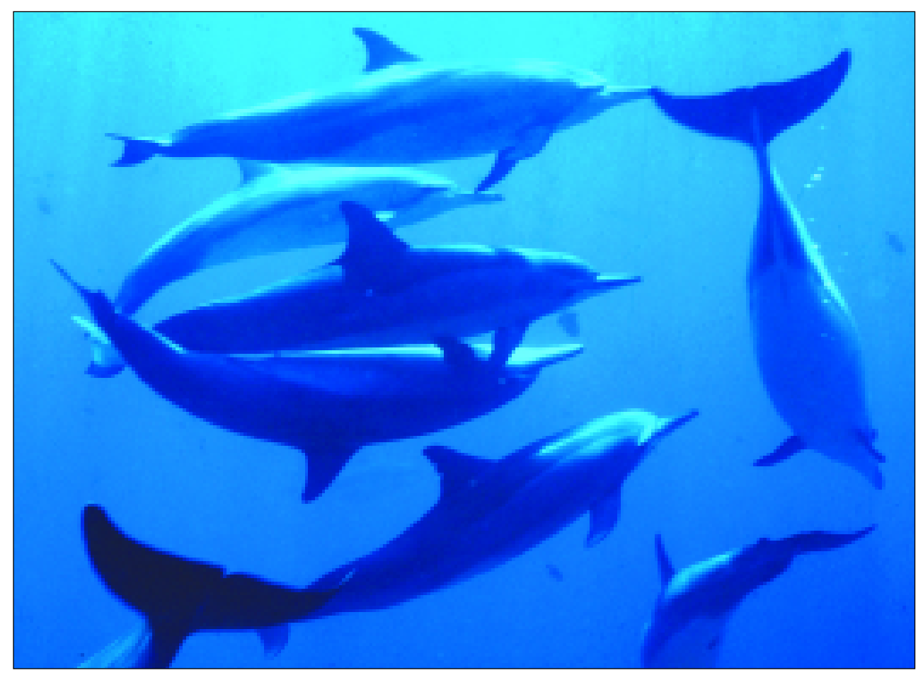
Fig. 6. A group of spinner dolphin males surrounding a female, one male (upside down) copulating.