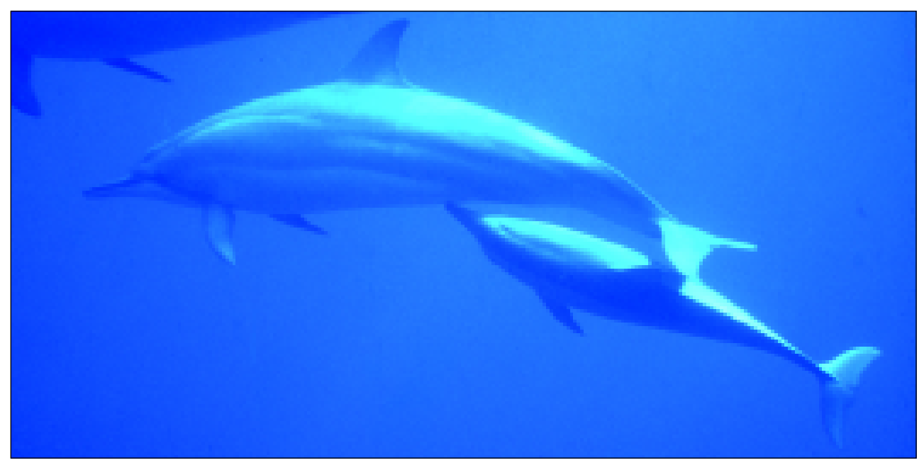
Fig. 3. A juvenile spinner dolphin about to suckle, nudging the female's genital slit with its beak.