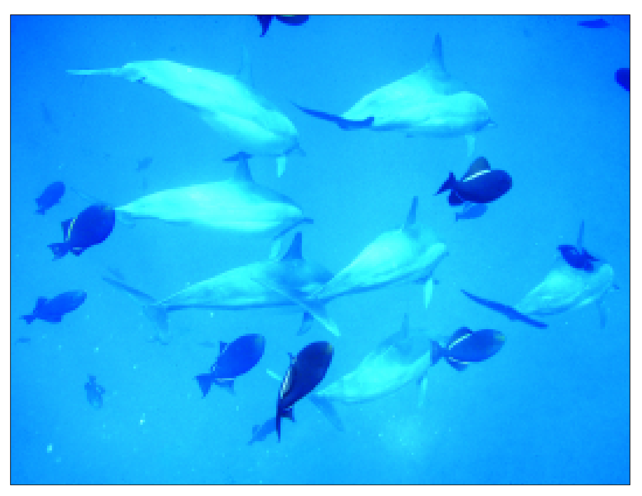
Fig. 14. A group of black durgons following a group of resting spinner dolphins cruising at low speed.

a while (Fig. 9), then release it and place it on the other flipper, or its tail or beak. A dolphin may play repeatedly in this way with the same piece of seaweed, or let it drift away after holding it on the flipper for a while or after a tail pass. During the play, the dolphin would not have any problems balancing and holding on to the seaweed, irrespective of its manoeuvring within the group. If then dropped, the same piece of seaweed may be taken by a following or flanking dolphin, which would play with it for a while in the same way. We also recorded two dolphins playing together with the same piece of seaweed, each of them taking its turn, up to about 10 times over the study period. Sometimes two or three dolphins in an observed group carried a seaweed piece each.